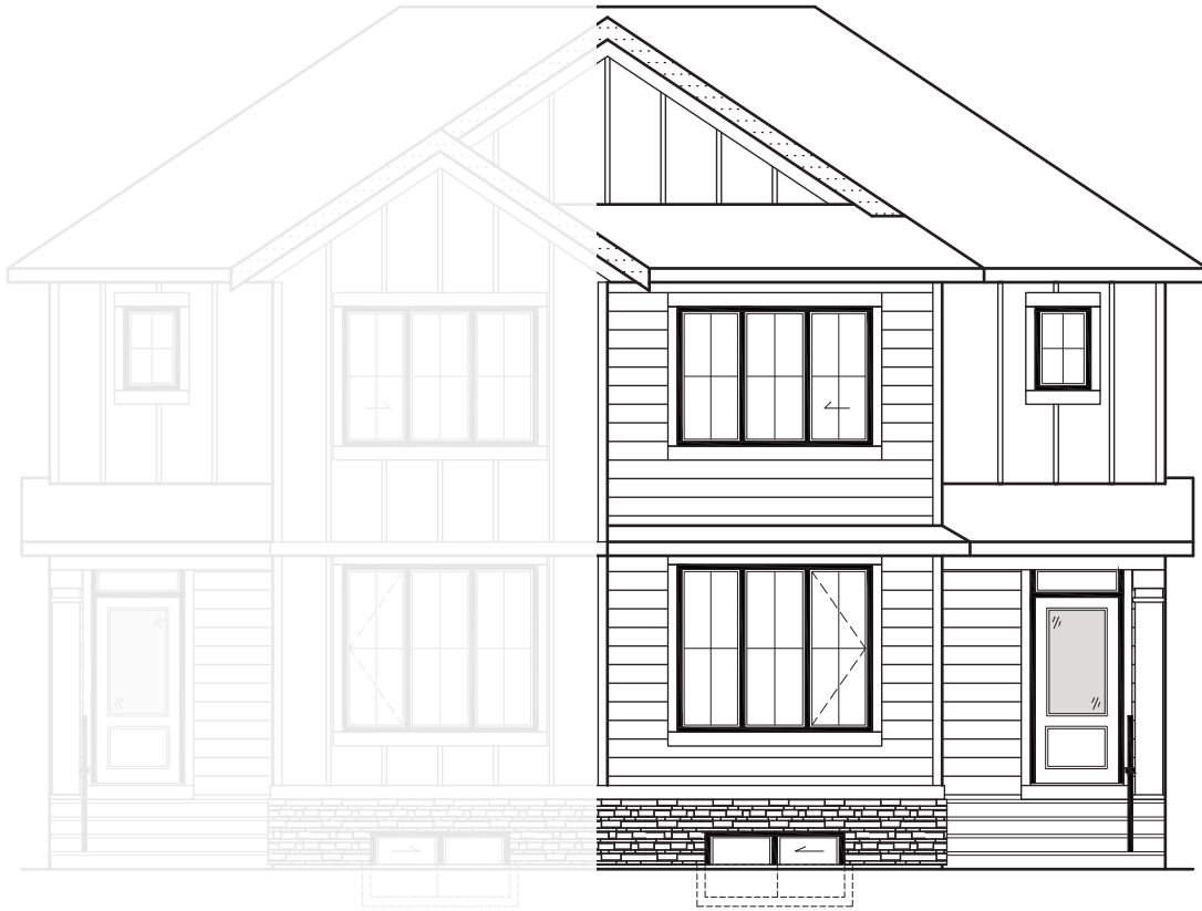
FARMHOUSE - FSCL 2 EXTERIOR COLOURS ARE NOT EXACT